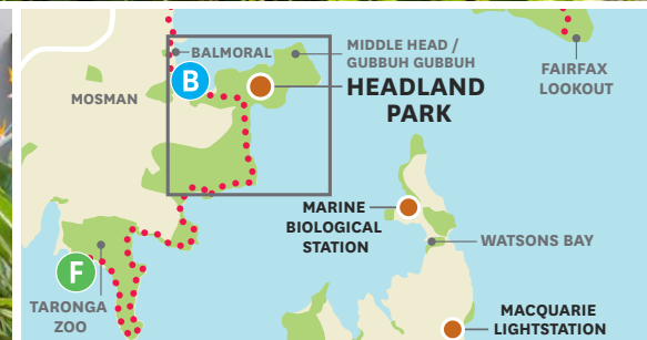
Above: Location image.

Find this great health practitioner/office space in a vibrant, eco-friendly setting nestled in Headland Park, Mosman with ample parking; surrounded by natural landscapes and incredible harbour views. Available July 2025.