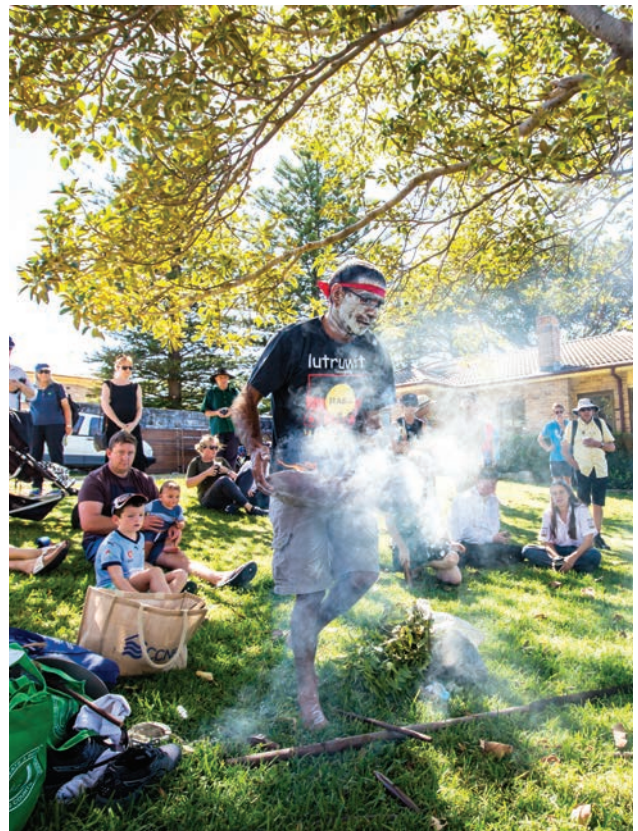
IMAGE: eNorth Head Discovery Day, Welcome to Country & Smoking Ceremony, 2018

View the North Head Sanctuary Consultation Outcomes Report and First Nations North Head Sanctuary Consultation Outcomes Report .