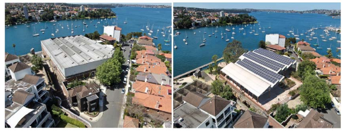
Figure 16: View of the Torpedo Factory currently (left) and proposed (right) from the northwest.