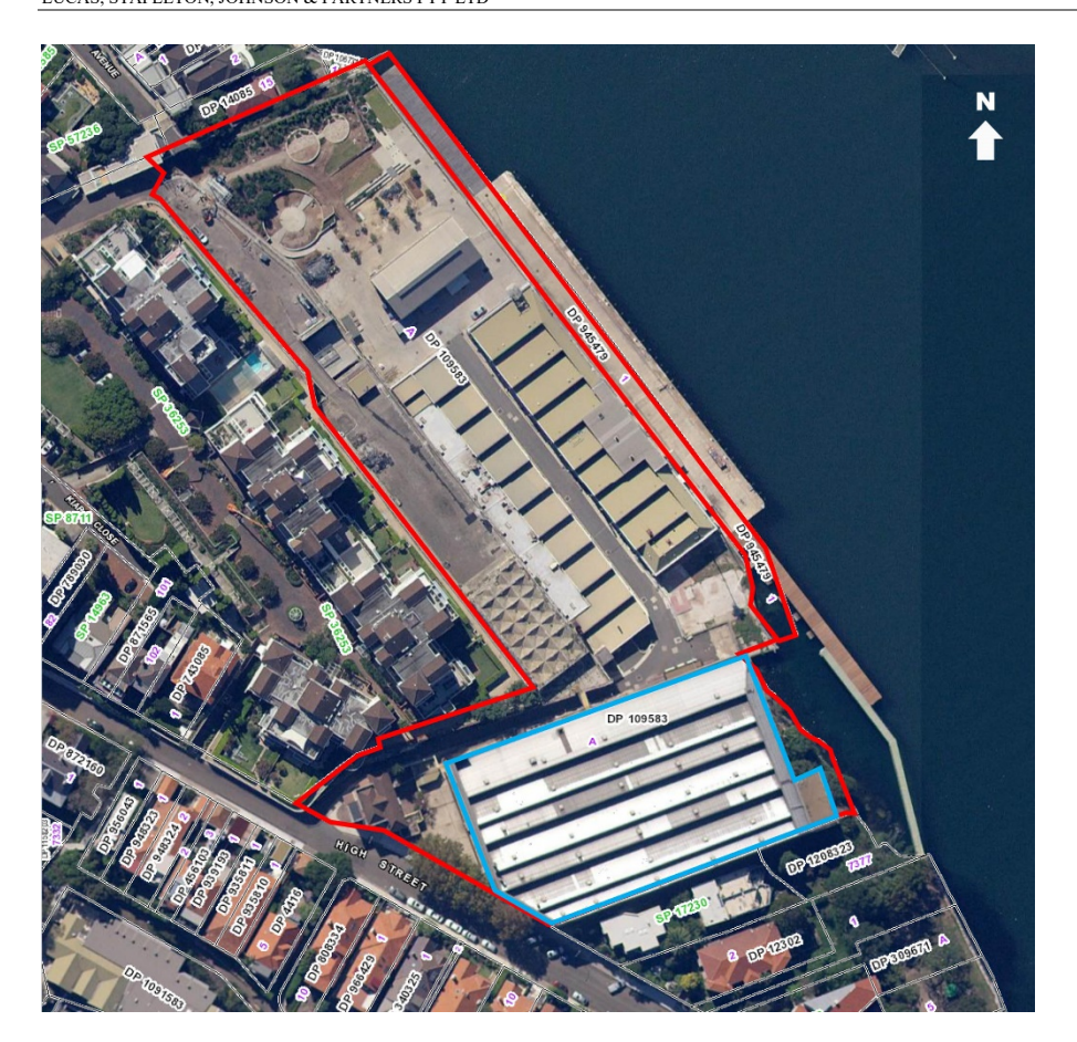
Figure 2: Aerial view of the locality showing the cadastral boundaries for the site and identifying the boundaries of the Harbour Trust land, including the land leased from RMS (in red). The Torpedo Factory is outlined in blue and is located in Lot A DP 109583.