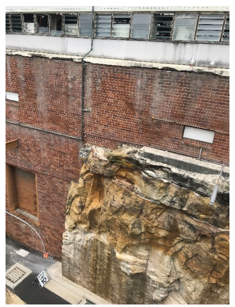
Figure 11: View of line of cut in sandstone base the factory building sits on.