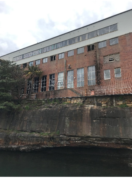
Figure 10: Eastern elevation of factory building, viewed from the Kesterton boardwalk linking the Sub Base Platypus site to Kesterton Park.