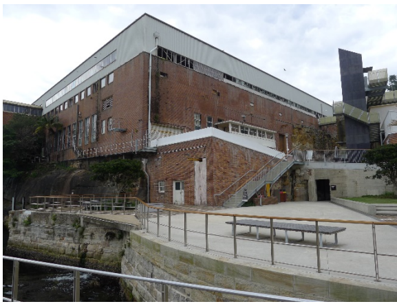
Figure 5: View south towards eastern end of Torpedo Factory.