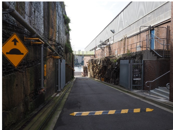
Figure 4: Entry approach from High Street. The Torpedo Factory building is on the right.