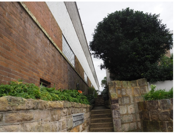
Figure 9: View from High Street east along southern elevation