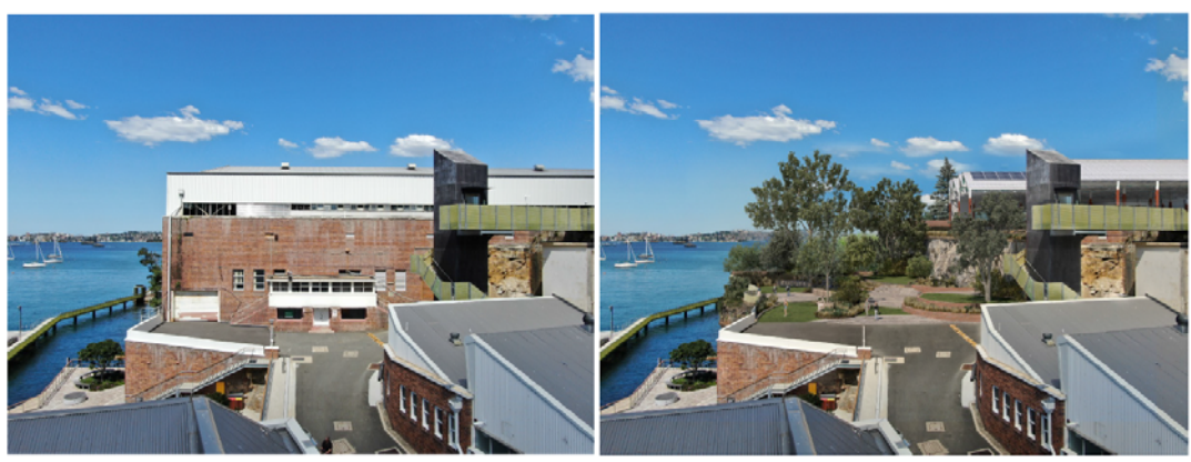
Figure 18: View of the Torpedo Factory currently (left) and proposed (right) from within Platypus looking south.