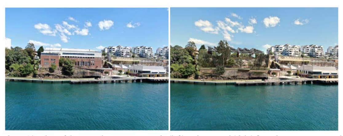
Figure 19: View of the Torpedo Factory currently (left) and proposed (right) from the east over Neutral Bay.