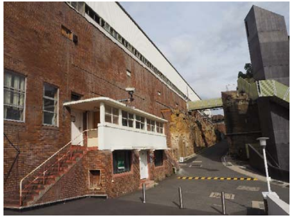
Figure 6: Looking back towards entry driveway along Platypus Lane, showing the factory building to the left with linking walkway from recently constructed lift shaft.