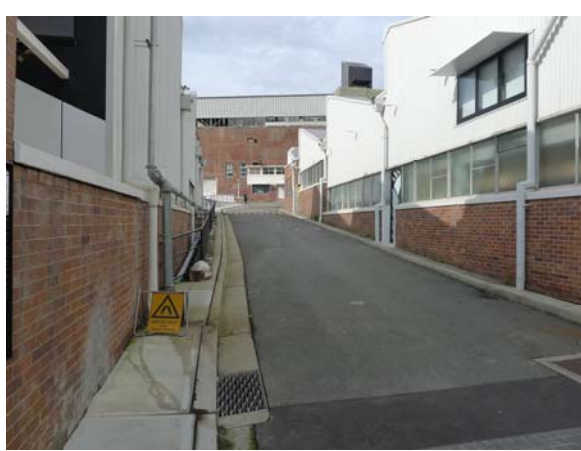
Figure 13: View looking south to the Torpedo Factory between the former sub marine school and former workshop building.