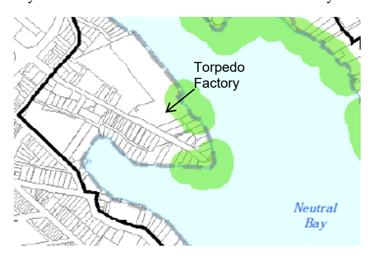
Figure 21: Detail from SREP ( Sydney Harbour Catchment ) 2005 Wetlands Protection Area Map identifying the location of Wetlands Protection Areas under the SREP (shaded in green) and the location of the adjacent Torpedo Factory.

As part of the application process for the proposal, Roads and Maritime Services, NSW Fisheries and NSW Environmental Protection Authority (EPA) will be notified of the proposed development and any comments received will be taken into account by the Harbour Trust.