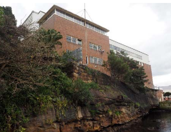
Figure 7: South-eastern corner of factory building, viewed from the Kesterton Boardwalk linking the Sub Base Platypus site to Kesterton Park.