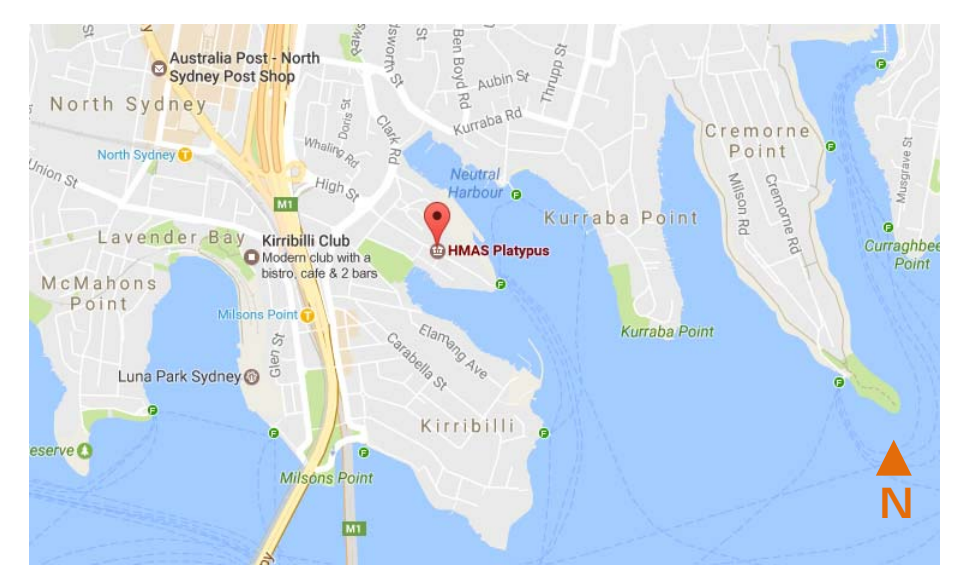
Figure 1: Street map showing location of subject property (indicated in red).

The lower levels of the Torpedo Factory are currently vacant and unused, while a portion of the upper level is currently used for public car parking (timed) to Sub Base Platypus.