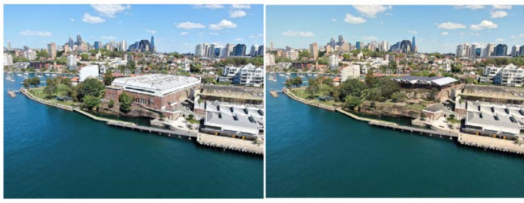
Figure 15: View of the Torpedo Factory currently (left) and proposed (right) from the northeast.