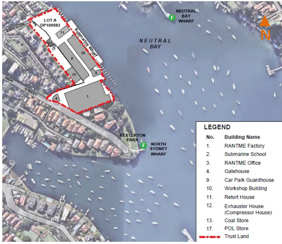
Figure 3: Extract from Management Plan 2016 identifying the boundaries of the site and the various buildings. The Torpedo Factory is identified as Building 1. Note that Buildings 3 and 9 have since been demolished.