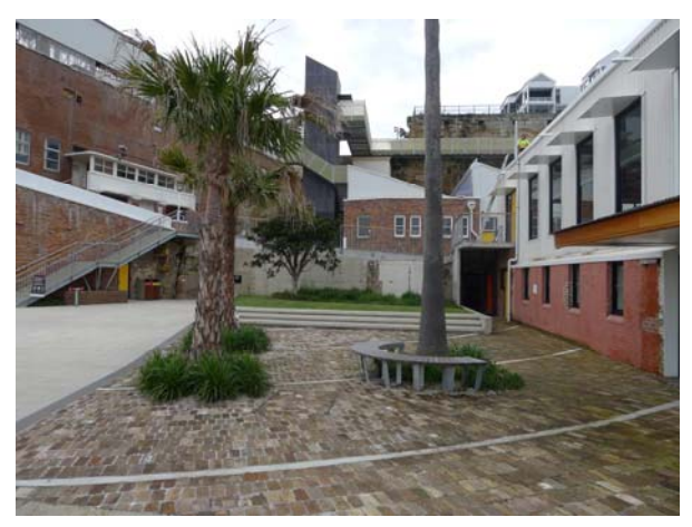
Figure 14: Public plaza (Wirra Birra Place), at the location of former RANTME office (Building 3).