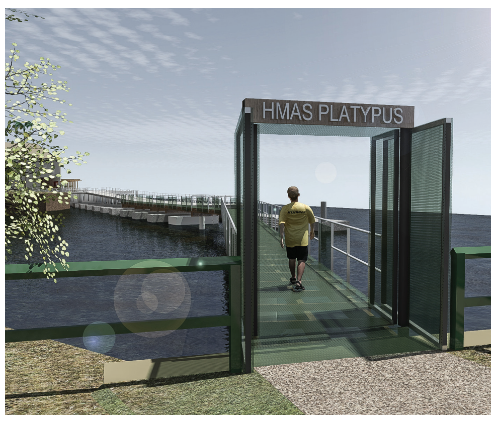
Over-water walkway viewed from Kesterton Park

The revitalisation of Sub Base Platypus will be ongoing - future proposals for new uses that involve significant works or operational impacts will be subject to further community consultation and planning assessment, as proposals arise.