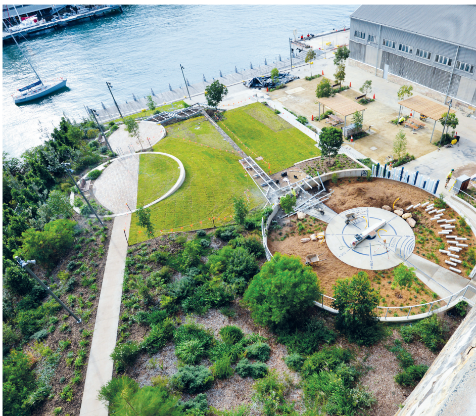
Pictured: Construction in progress of the new pocket park.

We encourage you to walk or cycle to the site as there is no onsite public parking.