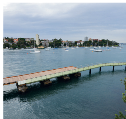
The new overwater link.