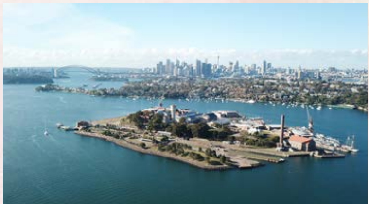
Cockatoo Island (Wareamah)

The following pages outline our methodology, the cultural and historical significance of the Island as shared with us by the stakeholders, and the First Nations Community's visions and aspirations for its future.