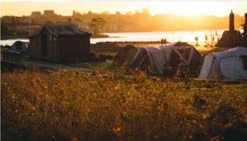
Cockatoo Island (Wareamah)

Stakeholder sentiment was mixed with regards to the clan/totem poles. The concept of acknowledging multiple clan groups in a sculpture as being significant to Wareamah was broadly well received, however it was noted that the way in which the Draft Concept Vision presents this concept is represented as appearing like totem poles. Totem poles are not something that is used by local First Nations peoples with one Traditional Owner sharing “clan poles are not our way” and another asking “where does the idea come from, make sure it is not appropriating another First Nations Country. Who are the four clans?”.