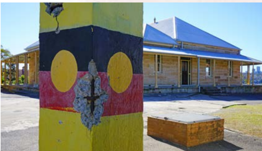
Existing structures on Wareamah

Stakeholders also discussed the importance of preserving the existing cultural remnants on the Island including those from pre-colonial times, and those that were created in post-colonial times. One stakeholder expressed, "please mark and protect the rock carvings etc. Please also respect and encourage visitors to respect the women's-only and/or men's-only spaces."